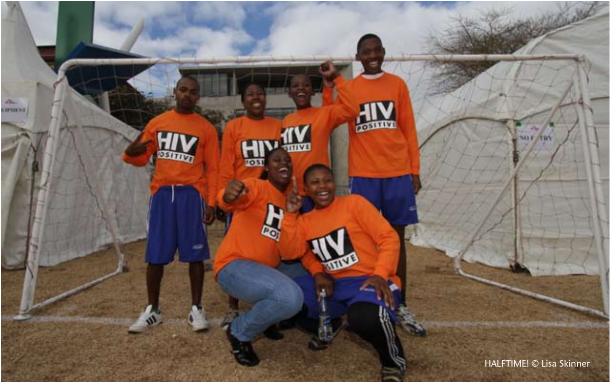
HALFTIME! © Lisa Skinner

Find out more, read the Extra-Time blog and watch the video: www.msf-halftime.info