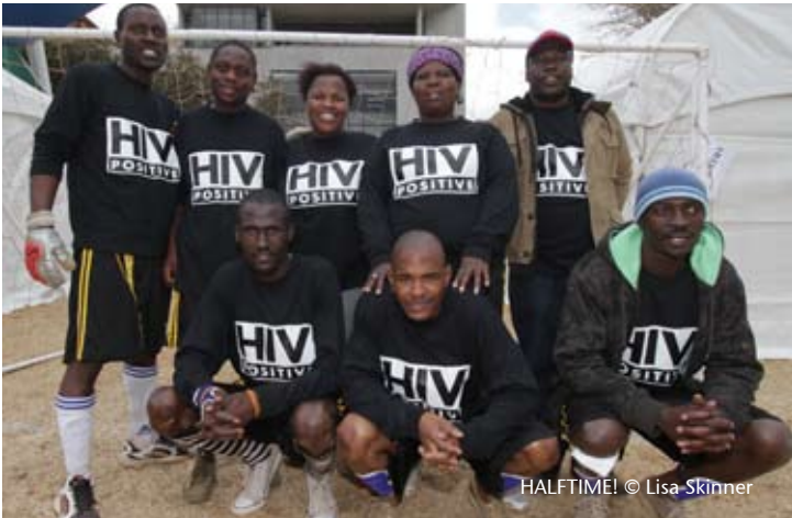
HALFTIME!