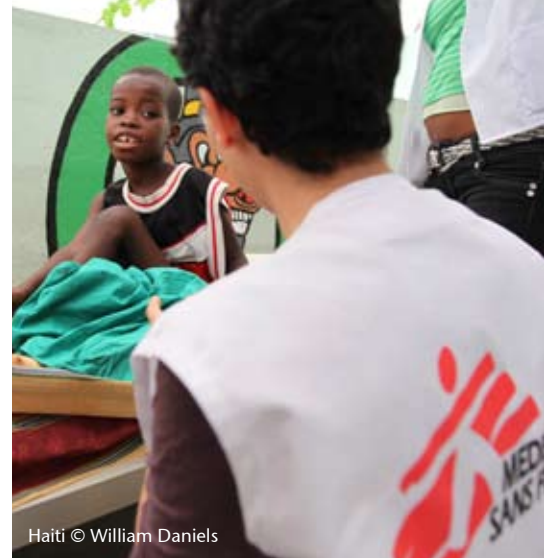
Haiti