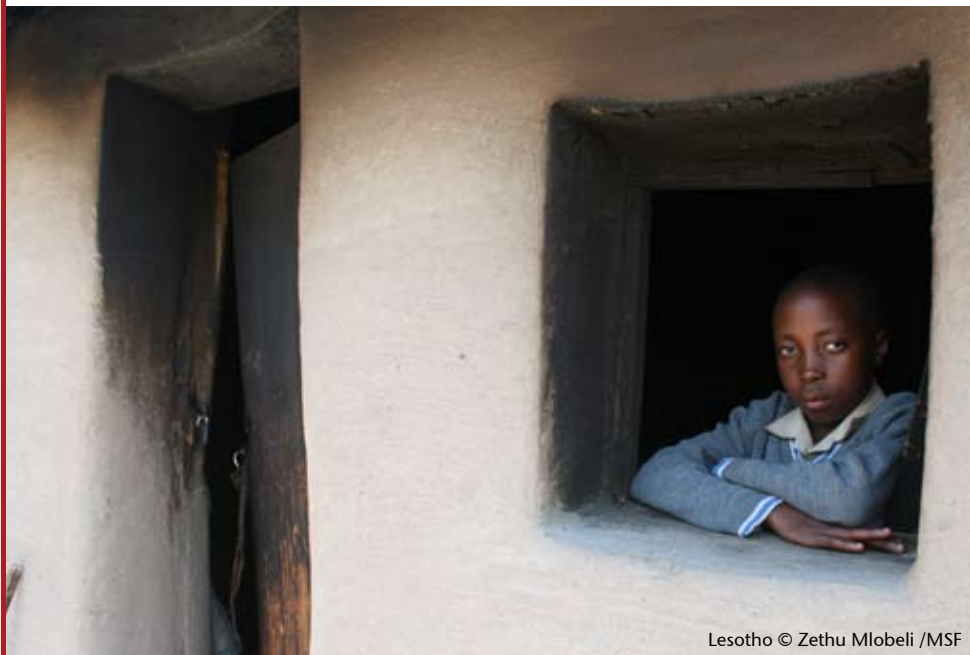
Lesotho