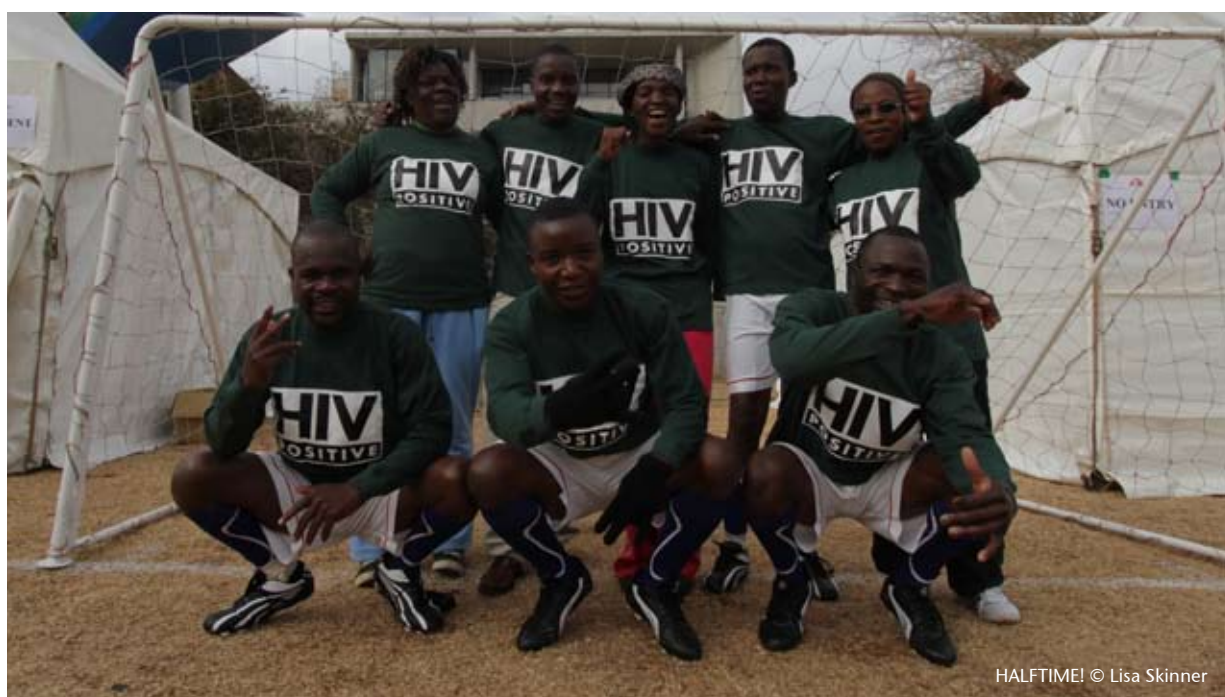
HALFTIME!

The OI Bombers entered the tournament as underdogs, but quickly proved their mettle by becoming the top scoring team with 12 goals and winning the tournament – proving to the world and international HIV/AIDS treatment funders that halftime is no time to quit!