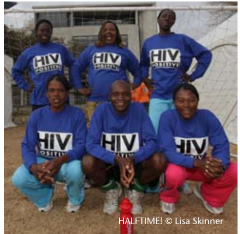
HALFTIME!