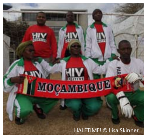
Mambinhas from Mozambique

Protesting against this reversal, HALFTIME! brought together people living with HIV from across Southern Africa to compete in a unique five-a-side football tournament in Johannesburg. Six teams of people living with HIV and MSF staff working in HIV treatment projects from South Africa, Zimbabwe, Mozambique and Swaziland participated. Other matches were hosted in Belgium, Switzerland, Germany and Malawi.