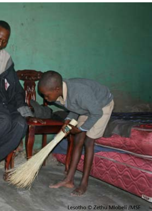
Lesotho