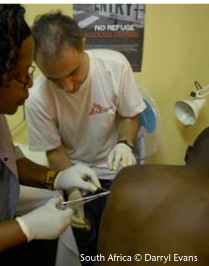
South Africa

In Johannesburg, MSF set up a primary health clinic for these migrants who are often turned away from already burdened South African health facilities because they do not speak the language or don't have the money to for pay the consultations.