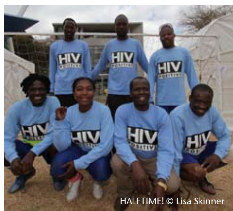
HIV Conquerors from Swaziland