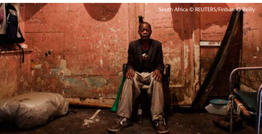
South Africa