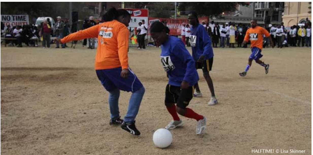
HALFTIME!