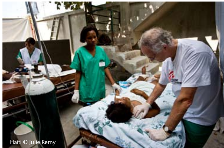
Haiti