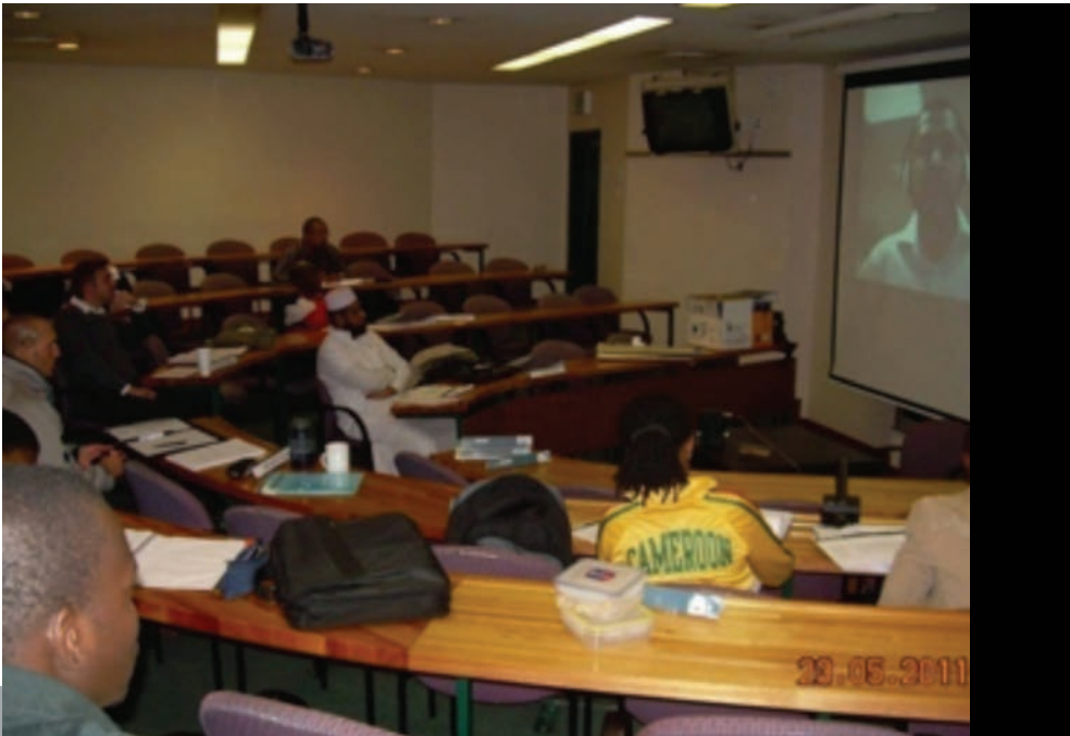
Lecture via web video web link-up with DHA Alumni at Al Jazeera, Doha.

The learning gained from this intense six-week period, as reflected in the student evaluations, has been extensive. Many students commented that the programme has increased their ability to analyze complex contexts and to critique their work, and that it has challenged some of their fundamental preconceptions of humanitarianism in a way that will improve the way in which they work.