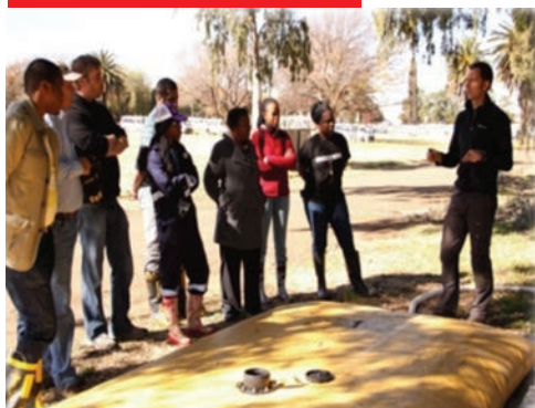
Water, Sanitation & Hygiene practical day hosted by Ekurhuleni Municipality