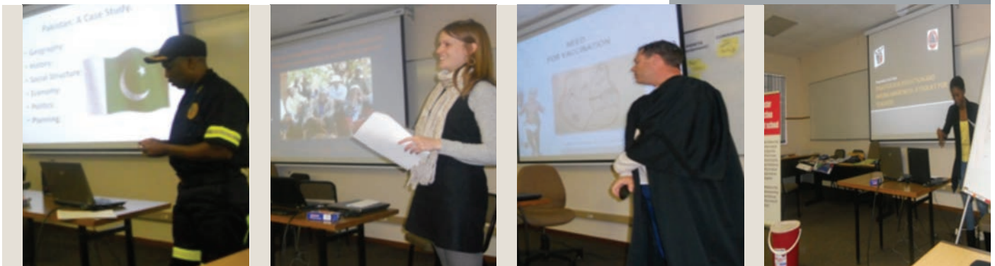
Students delivering their individual presentations on various topics

To promote synergy of emergency humanitarian interventions and sustainable development.