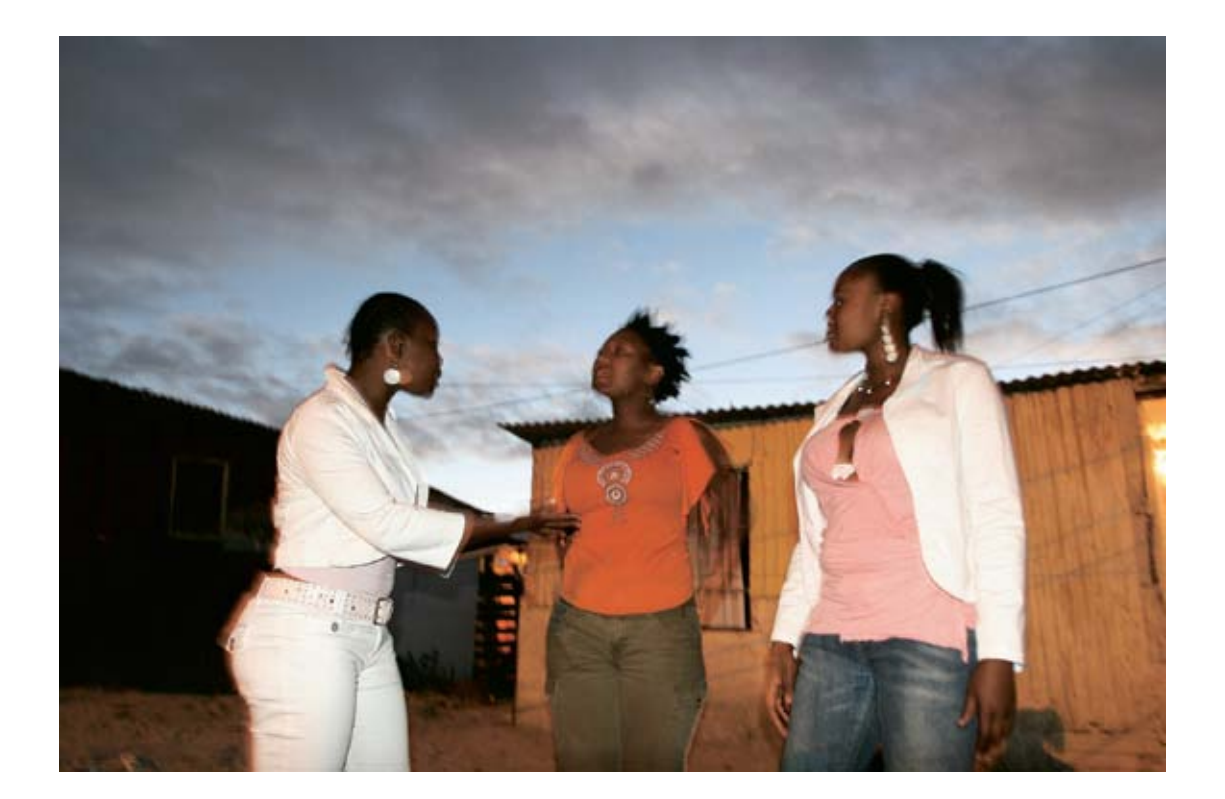
Photo: These three girls were alone in this shack when two thieves kicked in the door to steal their mobile phones. One girl was raped during the burglary.

Society must reject rape myths and change their attitudes towards women and violence.