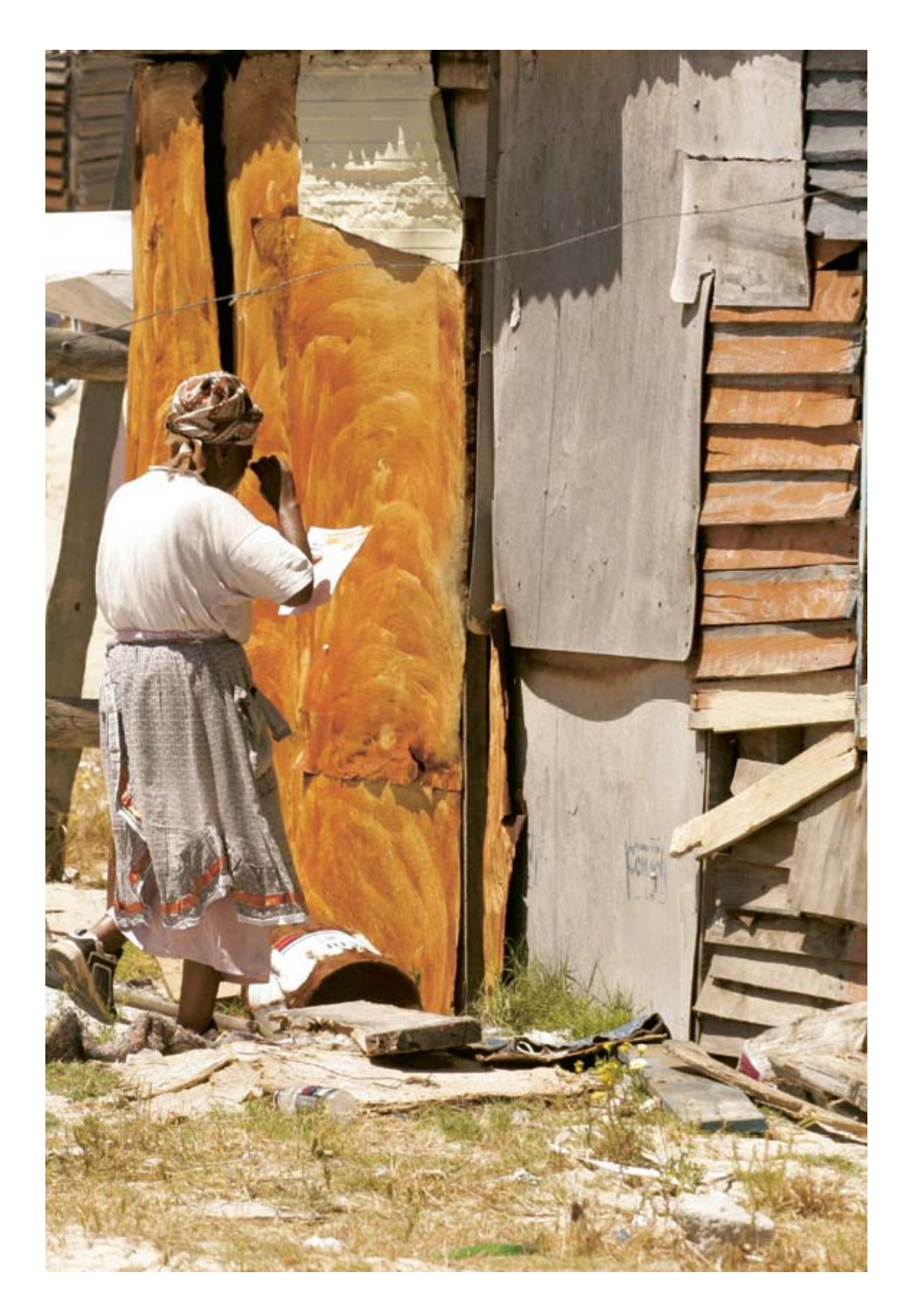
Photo: A woman in Khayelitsha has just received a Simelela flyer informing her of the health risks of rape, and the services available. Over 10 000 of these leaflets were distributed in some of Khayelitsha's most troubled areas in December 2005.