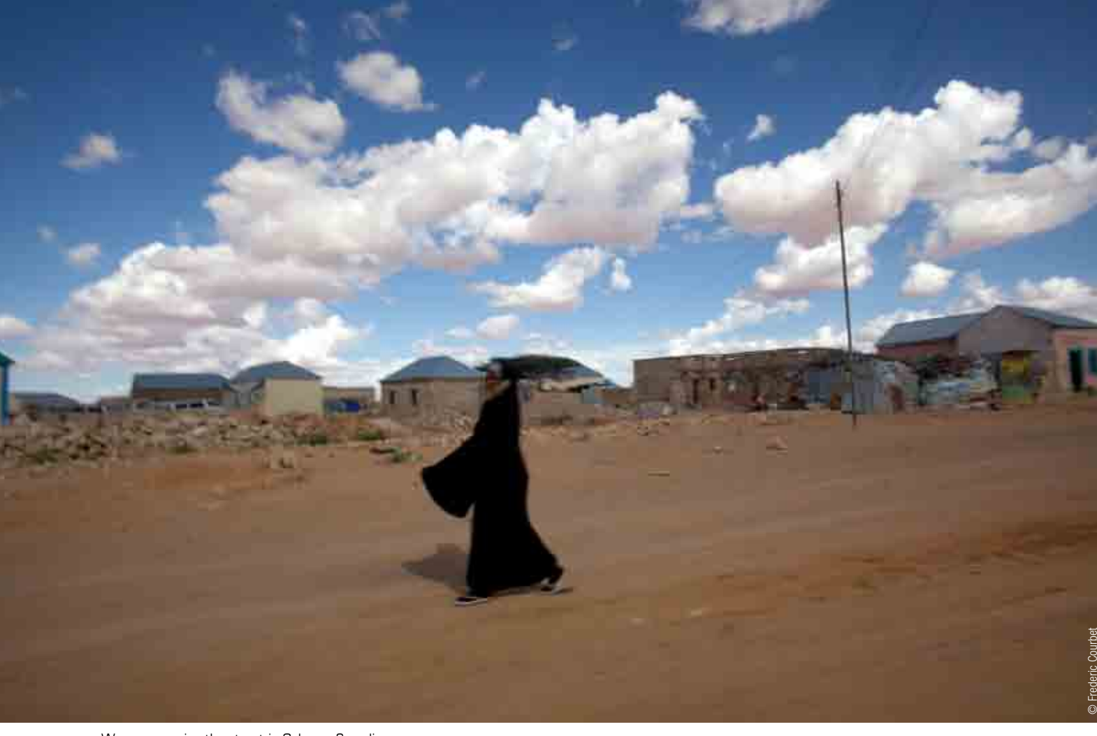
Woman crossing the street in Galcayo, Somalia.