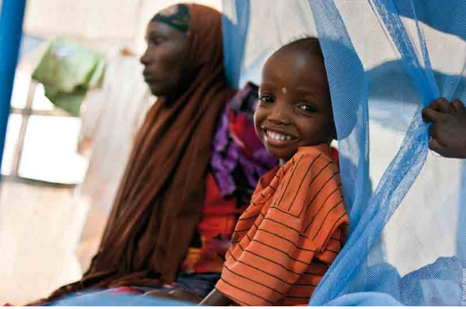
A mother and her 3-year-old son have been in the therapeutic feeding centre of Dolo Health Center for 17 days because the child was severely malnourished. "We are from Gedo, and for the last ten years, we have had to flee to Ethiopia regularly because of war or drought.".