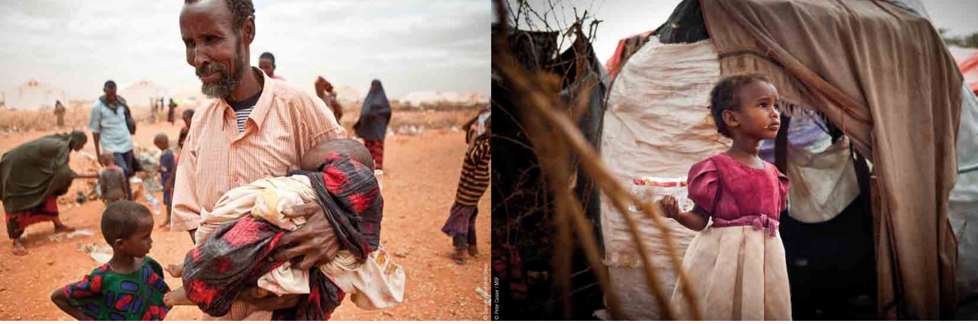
All new arrivals are screened for disease and malnutrition at the Dolo Ado border crossing from Somalia into Ethiopia.