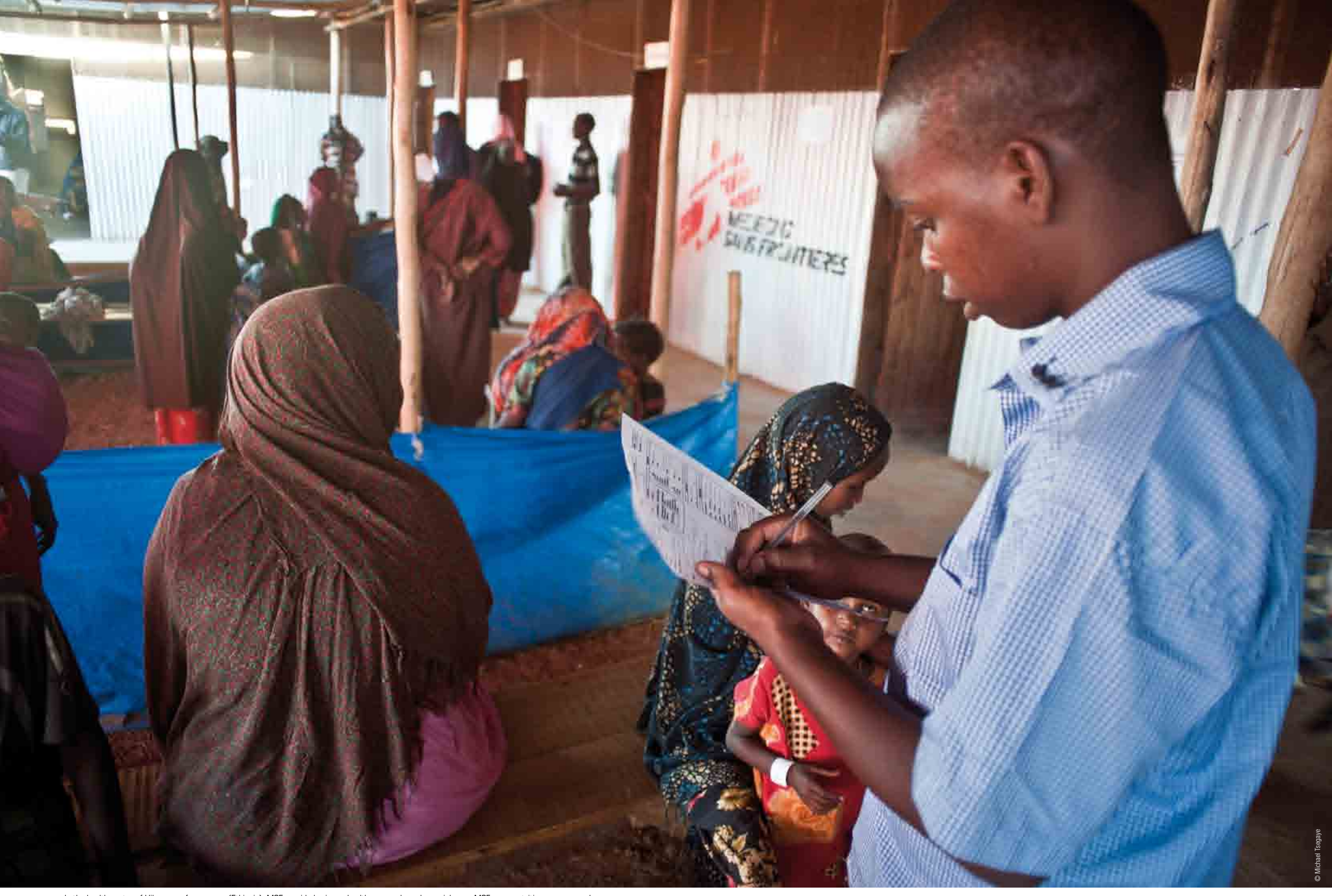
In the health centre of Hiloweyn refugee camp (Ethiopia), MSF provided primary health care and psycho social care. MSF ran a nutrition program and an outpatient department in the camp between July and December 2011. Cover: Parents waiting to have their children weighed in an MSF clinic in Dadaab, Kenya.