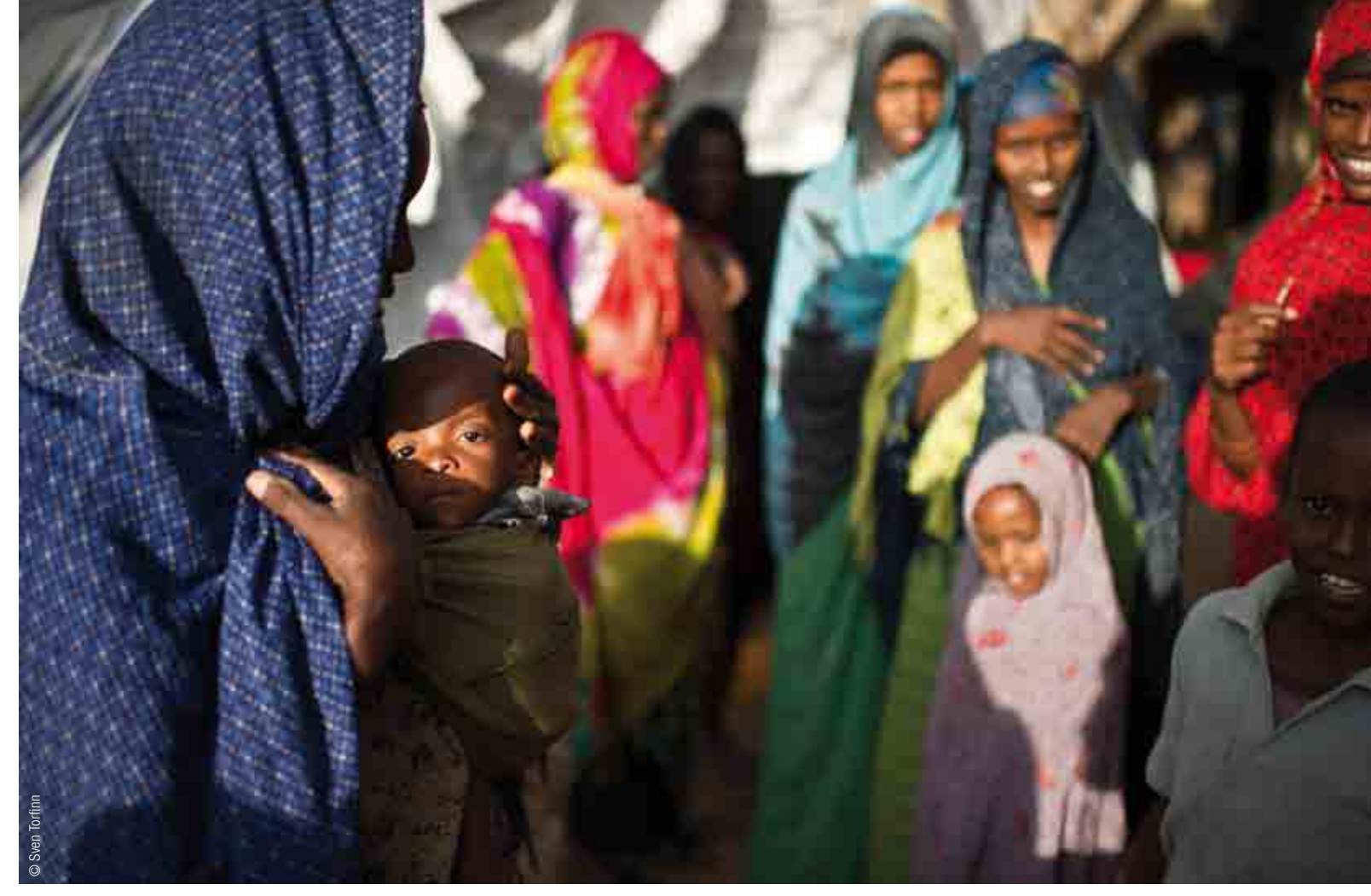
Women waiting in front of the therapeutic feeding centre at the hospital MSF runs in Galcayo South, Somalia.

There is violence, poverty and mismanagement in my town. My sons refused to join the fighting so one was wounded, the other killed. I was threatened and I had to flee. I escaped at night and travelled by foot for more than 30 days. There was no food so I had to eat tree leaves. I was arrested and interrogated before I could continue to Ethiopia. I will not go back home until there is peace. Man, 40, from Lower Juba