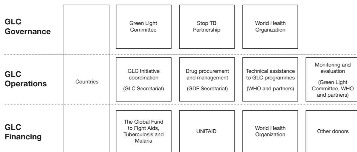
Diagram 1: The GLC Initiative

For other second-line anti-TB drugs that are recommended in WHO MDR-TB treatment guidelines and are not listed above, GDF and IDA can supply quality-assured drugs at best available prices.