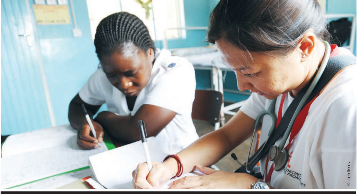
A medical doctor during a mentoring session with a nurse