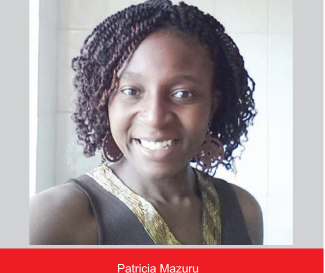
MSF OCA Communications Officer