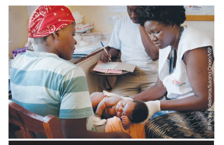
An MSF nurse providing post natal care to a newly born baby and mother who followed the Prevention of mother to Child Transmission (PMTCT) program. PMTCT is an important component of MSF's projects so as to prevent newborn infections.

MSF's briefing paper, "Maternal Death: The Avoidable