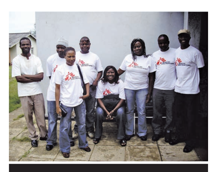
Part of MSF Gokwe team

This suggests that community based VCT is a viable option for increasing HIV testing in areas where uptake of testing is low. MSF has taken the responsibility to implement community based VCT campaigns to reach out to one and all. Prevention strategies such as VCT