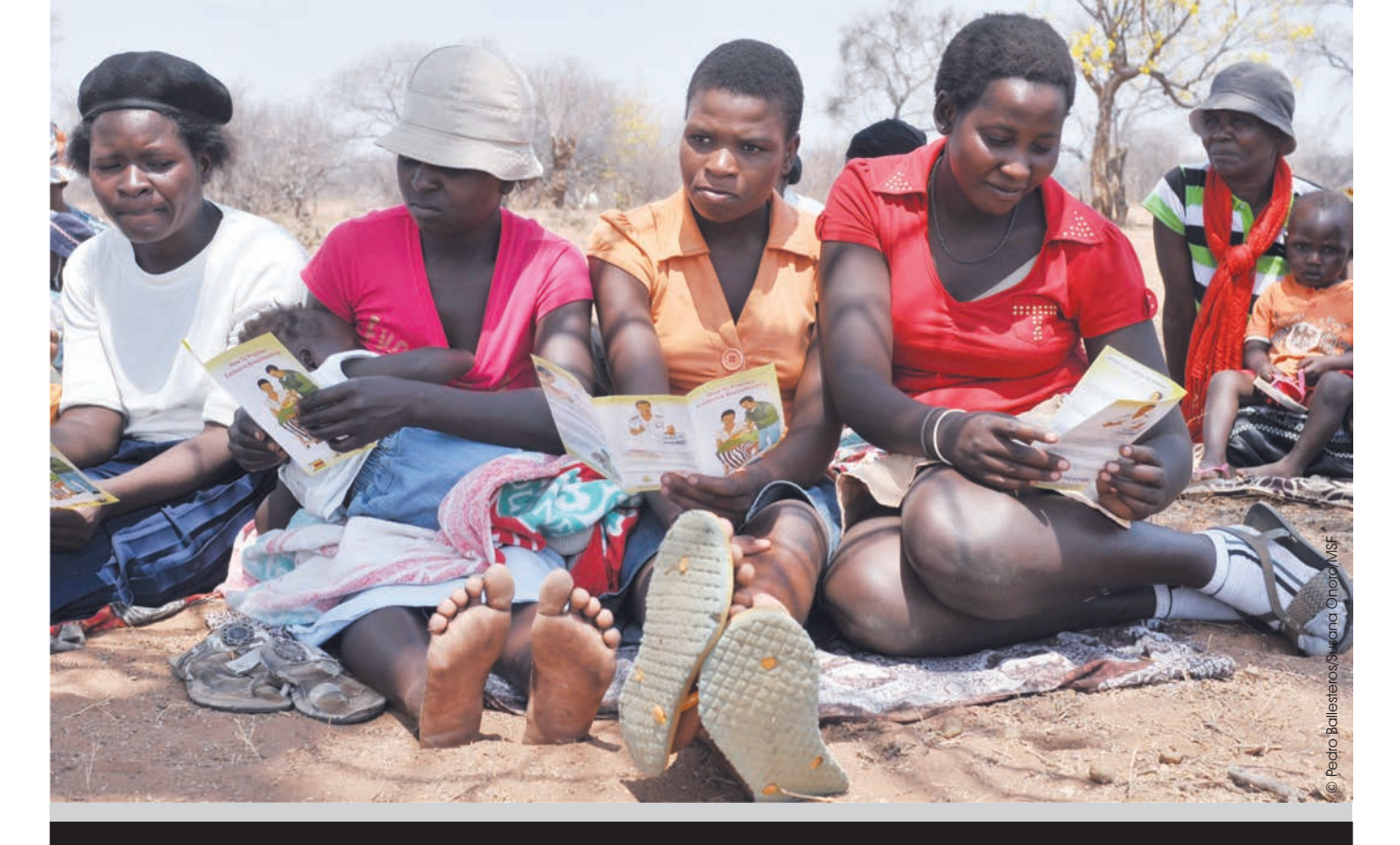
Community support groups improve in the success of health programs