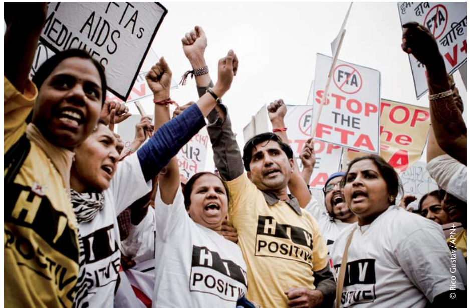
In March, nearly 4,000 people marched in the streets of New Delhi to protest a free trade agreement between India and the European Union that could restrict their access to the affordable medicines they need to stay alive.

Without renewed prioritisation of health, both politically and financially, recent scientific promise and policy advances look fragile. A landmark clinical trial showed conclusively this year that HIV treatment is a form of prevention , offering a glimpse of the possibility