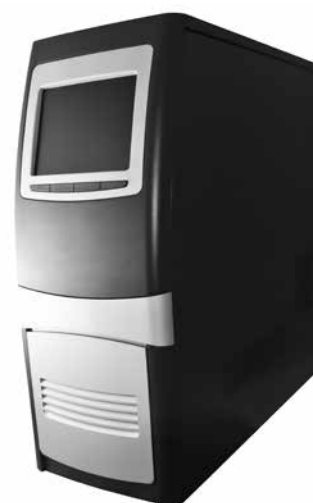
SaCycler - 96 (Real Time PCR)