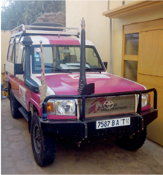
MSF vehicles in Ansongo

In MSF's view, the best way to differentiate from armed actors is to avoid collaboration