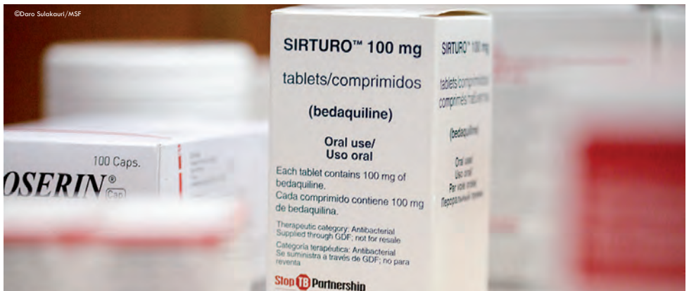
Bedaquiline, one of the new antibiotic drugs used to treat DR-TB at the National Centre for Tuberculosis and Lung Disease in Tbilisi, Georgia.

MSF is one of the biggest non-governmental providers of TB treatment care - including for DR-TB - in the world. MSF has TB treatment projects in 24 countries around the world, and in 2015 supported more than 20,000 TB patients on treatment, including 2,000 patients with DR-TB.