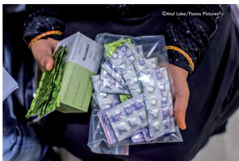
A DR-TB patient showing her TB medication in Mumbai, India.

endTB's clinical trial (a partnership between MSF, Partners in Health, Epicentre, Harvard Medical School and the Institute of Tropical Medicine Antwerp, financed by UNITAID), of which MSF is sponsor, will begin in late 2016. In collaboration with ministries of health, the clinical trial will involve 750 patients in six countries (potential sites include Georgia, Kazakhstan, Kyrgyzstan, Lesotho, Peru, South Africa), of which Georgia, Kyrgyzstan and South Africa are MSF projects. It will study the safety and efficacy of several "user-friendly" MDR-TB treatment regimens, each containing either bedaquiline, delamanid or both, in combination with old or repurposed drugs, for nine months, and without injectables.